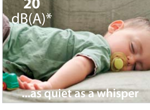
* measured at 2.5 m distance, at low speed.

In addition, the super quiet outdoor unit operation makes the system very unobtrusive, ensuring total comfort.